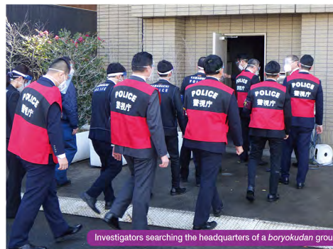
Investigators searching the headquarters of a boryokudan group