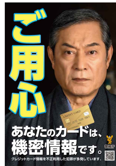
Public awareness poster

We are also promoting public awareness activities to prevent credit card fraud, a funding source for criminal organizations.