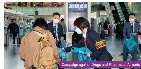
Campaign against Drugs and Firearms at Airports