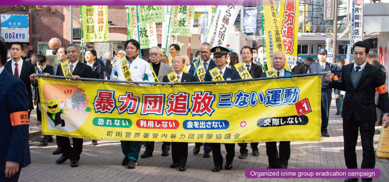
Organized crime group eradication campaign