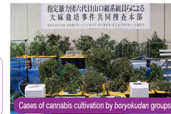
Cases of cannabis cultivation by boryokudan groups