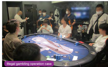
Illegal gambling operation case