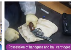
Possession of handguns and ball cartridges