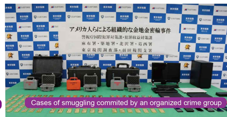
Cases of smuggling committed by an organized crime group