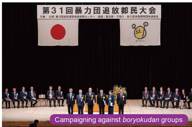
Campaigning against boryokudan groups