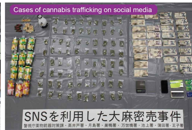
Cases of cannabis trafficking on social media