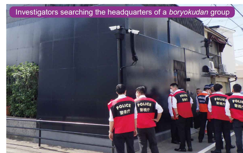
Investigators searching the headquarters of a boryokudan group

Telecom fraud is an important funding pipeline for crime groups, ranging from organized syndicates to loosely-bound tokuryu collectives whose members often don't know each other. In response, the TMPD has implemented a multifaceted inter-agency enforcement approach to better understand and target this crime and its perpetrators. We are also enforcing a variety of measures to dismantle these nefarious groups.