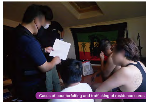
Cases of counterfeiting and trafficking of residence cards