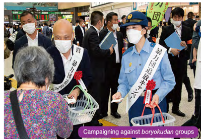
Campaigning against boryokudan groups