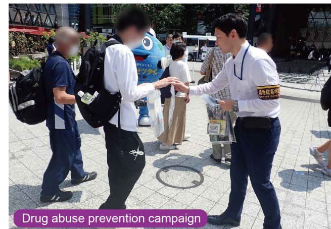
Drug abuse prevention campaign