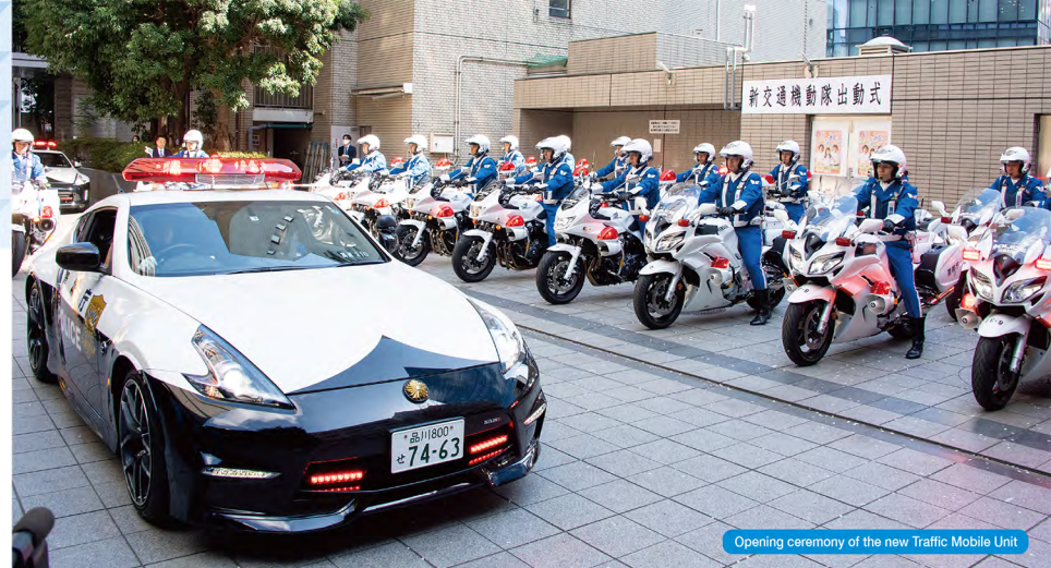
Opening ceremony of the new Traffic Mobile Unit

MAKING TOKYO'S ROADS THE SAFEST IN THE WORLD