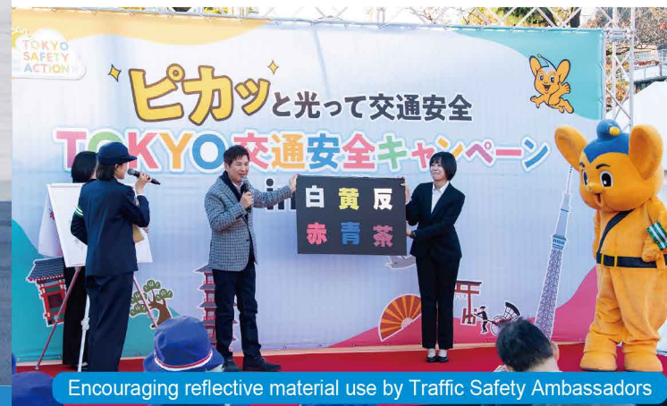
Encouraging reflective material use by Traffic Safety Ambassadors