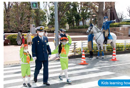
Kids learning how to cross a road safely