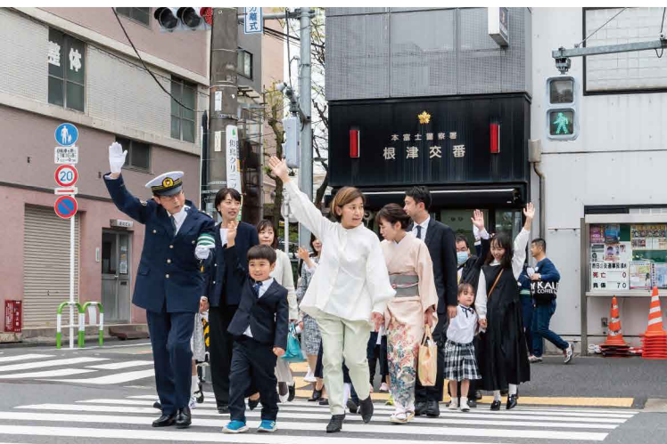
Traffic safety lessons for children