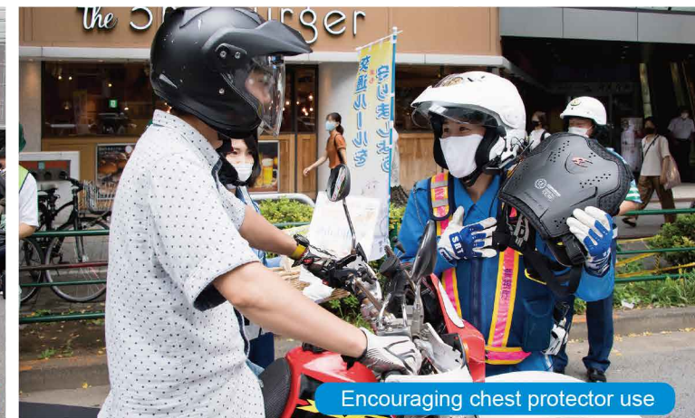
Encouraging chest protector use