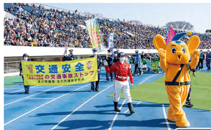
Traffic safety campaign

The TMPD offers a wide range of participatory and interactive traffic safety lessons practical for all ages in an effort to raise traffic safety awareness.