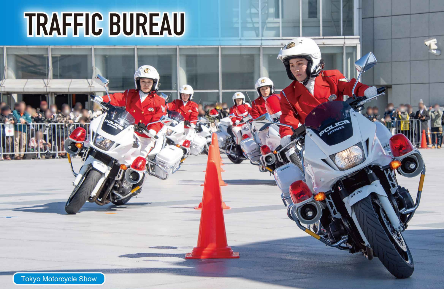
Tokyo Motorcycle Show