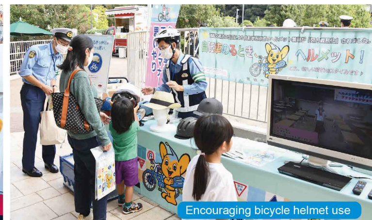
Encouraging bicycle helmet use