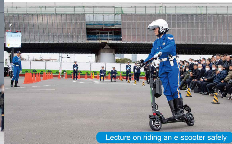
Lecture on riding an e-scooter safely