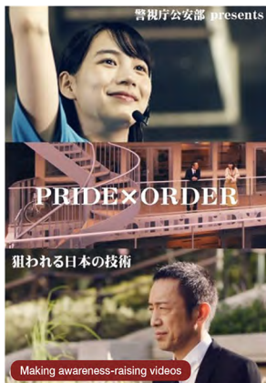
Making awareness-raising videos