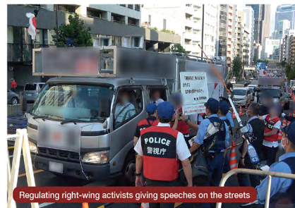
Regulating right-wing activists giving speeches on the streets