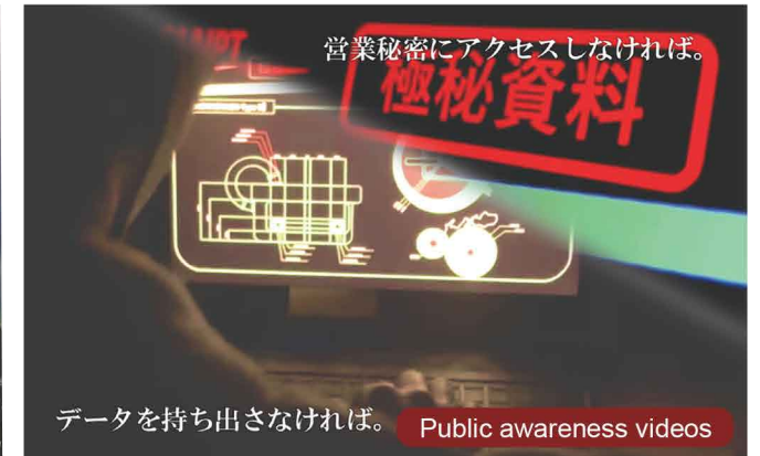
データを持ち出さなければ。 Public awareness videos

Scan the 2-D bar code for more information on efforts related to economic security (only in Japanese).