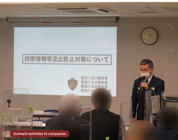
Outreach activities to companies