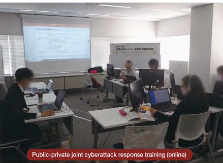
Public-private joint cyberattack response training (online)