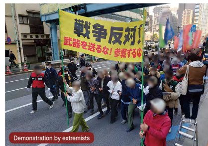
Demonstration by extremists