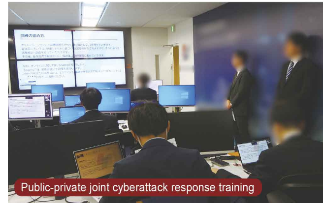
Public-private joint cyberattack response training

Scan the 2-D bar code for more information on countermeasures against cyberattacks (only in Japanese).