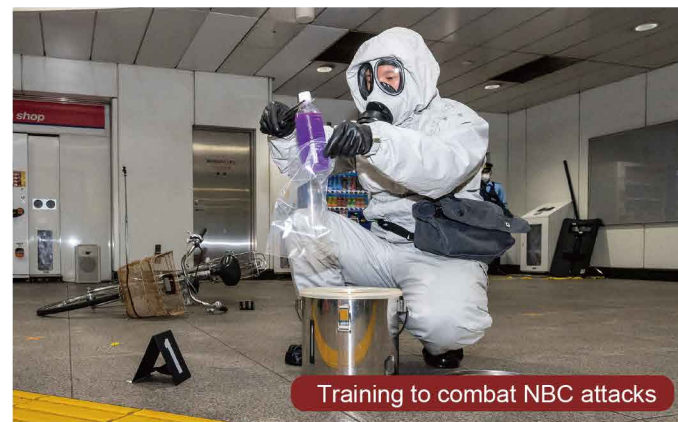
Training to combat NBC attacks

*An NBC attack is an act of terrorism using nuclear (N), biological (B), or chemical (C) substances.