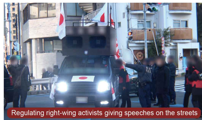
Regulating right-wing activists giving speeches on the streets