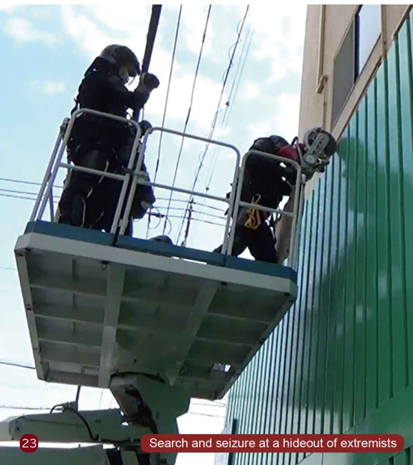
Search and seizure at a hideout of extremists