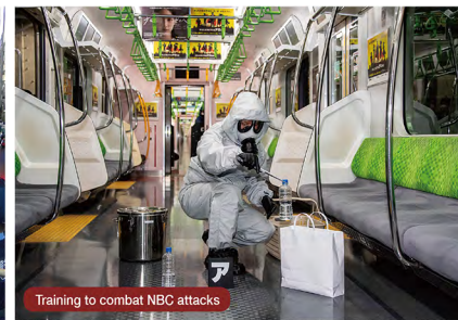
Training to combat NBC attacks

*An NBC attack is an act of terrorism using nuclear (N), biological (B), or chemical (C) substances.