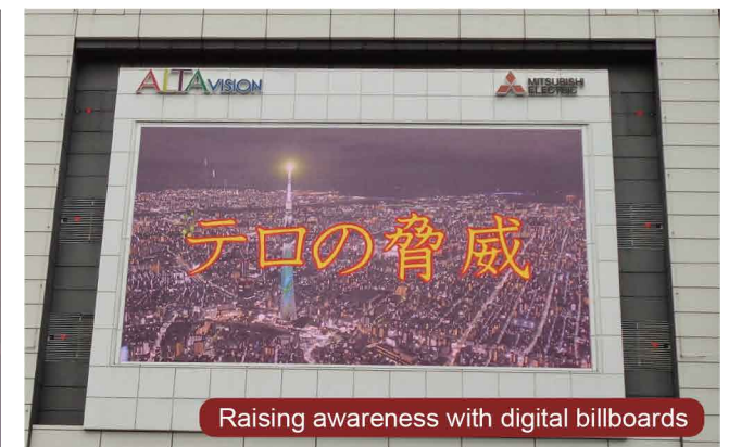
Raising awareness with digital billboards