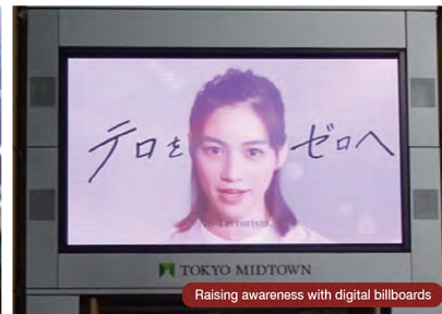
Raising awareness with digital billboards

Scan the 2-D bar code for more information on countermeasures against cyberattacks (only in Japanese).