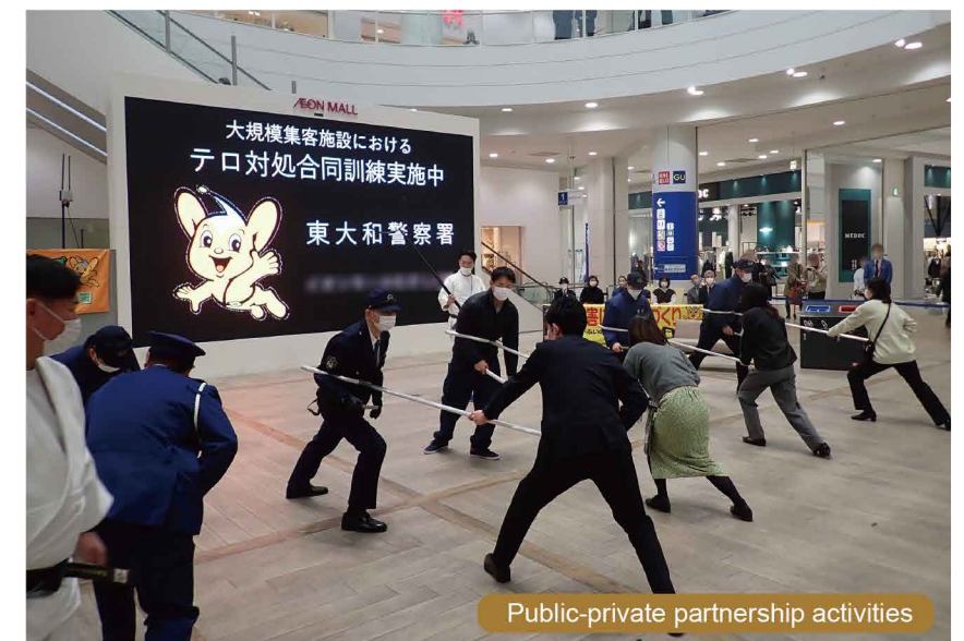
Public-private partnership activities

Similarly, local police stations form community partnerships with residents and private businesses under the slogan "Building a Community with Zero Tolerance for Terrorism" and take steps against terrorism according to their needs. These measures include joint drills, workshops, and patrols.