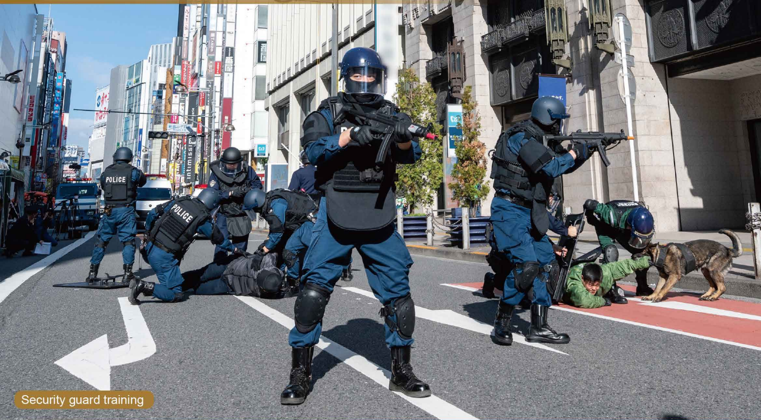
Security guard training