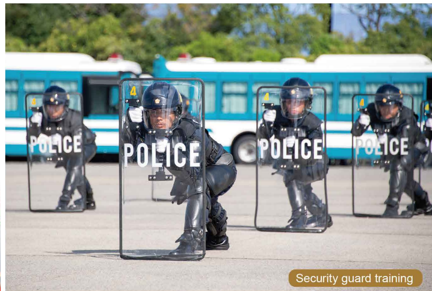
Security guard training

The Mobile Police Units play a central role in guarding government agencies and other key facilities, and providing security at large events. They are dispatched for various other purposes, such as providing security at disaster sites, ensuring traffic safety, and preventing crime, thus working to maintain public safety.