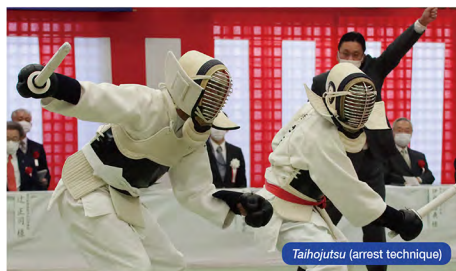
Taihojutsu (arrest technique)