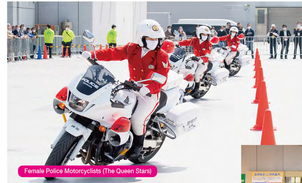
Female Police Motorcyclists (The Queen Stars)

To meet the diverse needs of our citizens, we are providing job opportunities based on skills and performance and working to achieve a workplace environment where women can thrive.