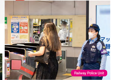
Railway Police Unit