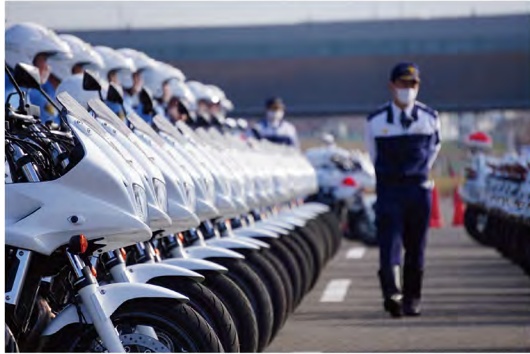
Police motorcyclist training

The TMPD provides highly-motivated officers with opportunities to obtain advanced skills and knowledge at institutions both in and outside the TMPD.