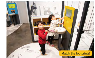
Match the footprints!