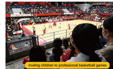
Inviting children to professional basketball games

As part of our goal to raise public awareness of the importance of victim support, the TMPD holds classes such as "The Importance of Life" and "What it Means to be a Victim of Sex Crimes". We also invite children who lost parents in criminal cases or traffic accidents to sporting events and concerts, aiding them in their effort to grow up with hopes and dreams.