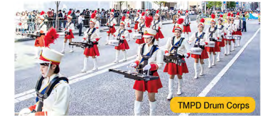
TMPD Drum Corps

These performances are instrumental in enabling officers and local citizens to interact with each other and to build trust.