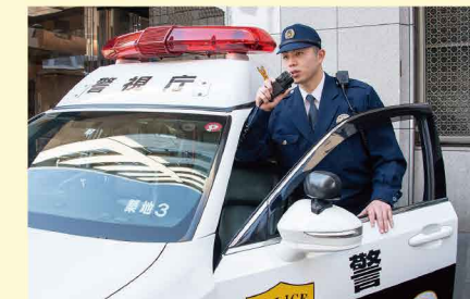
Heading to the scene