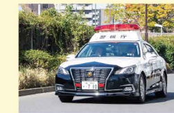
Pursuit by police car