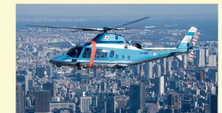
Pursuit by helicopter