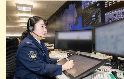
Receiving emergency calls