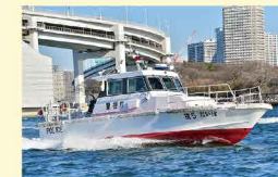
Pursuit by patrol boat