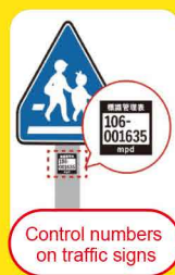
Control numbers on traffic signs