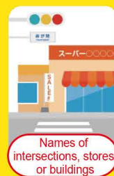
Names of intersections, stores or buildings