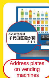
Address plates on vending machines