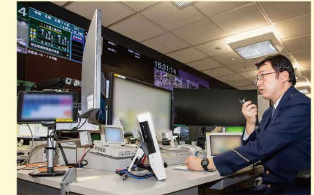
Giving radio commands to officers