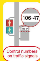
Control numbers on traffic signals