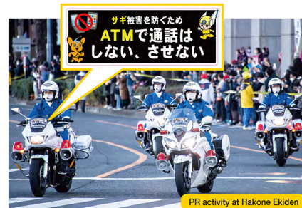
PR activity at Hakone Ekiden

As a countermeasure against an increasing number of refund fraud cases, the TMPD is promoting the "Stop! Don't Use Cell Phones at ATMs" campaign, so that the concept of "Do not talk or let others talk on cell phones at ATMs" gets widely spread and becomes a social rule.