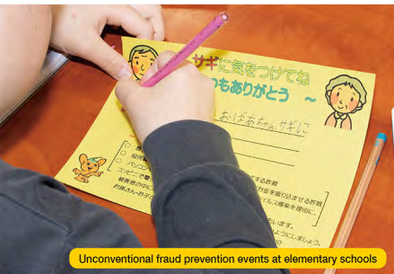
Unconvictional fraud prevention events at elementary schools