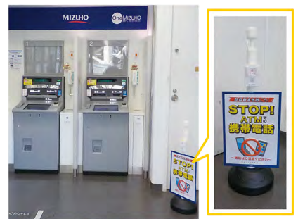
"Stop! Don't Use Cell Phones at ATMs" voice alarm