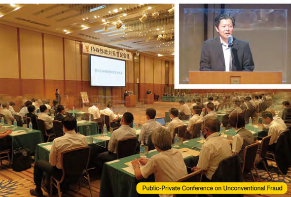
Public-Private Conference on Unconvictional Fraud