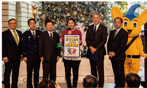
Unconvictional Fraud Prevention Campaign