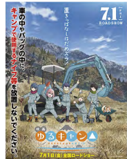
Collaboration with popular anime to raise awareness of the Firearms and Swords Control Act