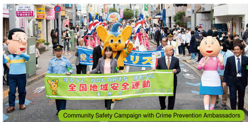
Community Safety Campaign with Crime Prevention Ambassadors