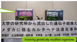
大学の研究所から流出した遺伝子組換えメダカに係るカルタヘナ法違反事件 警視庁 生活環境課、麹町署、浅草署、玉川署、立川署、四谷署、亀戸署 Involving genetically modified organisms