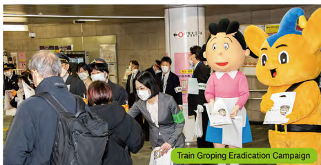
Train Groping Eradication Campaign