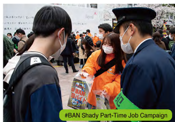
#BAN Shady Part-Time Job Campaign