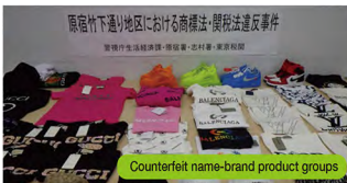
原宿下通り地区における商標法・景観法違反事件 警視庁生活環境課、原宿署、北村署、東原町署 Counterfeit name-brand product groups