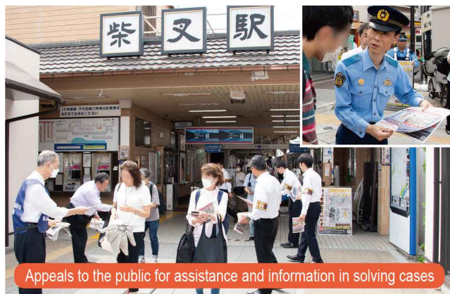
Appeals to the public for assistance and information in solving cases

There are many crimes that pose a threat to us in Tokyo: robberies, sex crimes, telecom frauds, and burglaries. The TMPD is working to understand and analyze these crimes in detail. We encourage swift and precise investigations, heading to crime scenes promptly and utilizing the latest investigation methods in order to solve cases as soon as possible.