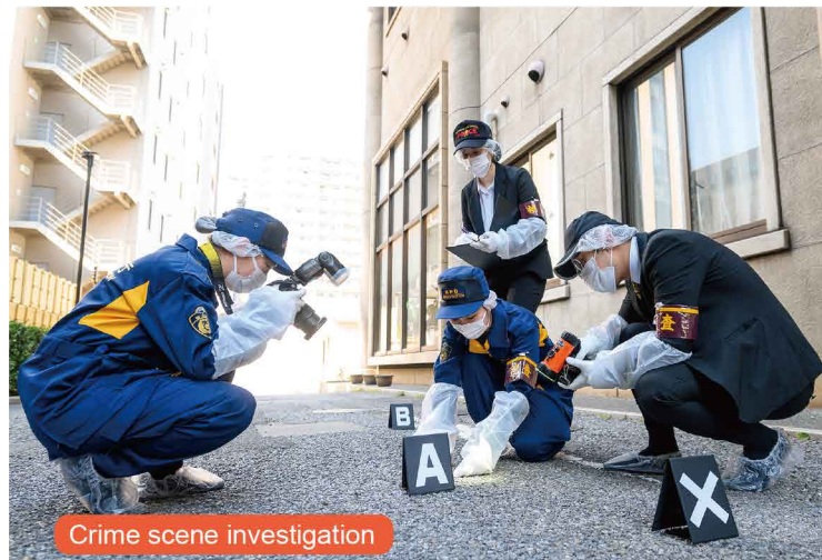
Crime scene investigation

There are many crimes that pose a threat to us in Tokyo: robberies, sex crimes, telecom frauds, and burglaries. The TMPD is working to understand and analyze these crimes in detail. We encourage swift and precise investigations, heading to crime scenes promptly and utilizing the latest investigation methods in order to solve cases as soon as possible.