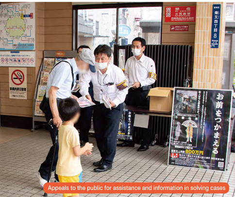
Appeals to the public for assistance and information in solving cases

*Unconventional fraud is a general term for a type of fraud in which the perpetrator sends e-mail to or calls the victim, claiming to be a relative or an official of a public institution. The perpetrator then defrauds the victim of cash or e-money, ATM cards, or deceives the victim saying that the victim can receive a refund of medical expenses and makes the victim operate an ATM to send money to the perpetrator's account. *The number of cases solved includes cases which were reported in previous years. For this reason, some crimes may have a solved rate of more than 100 percent.