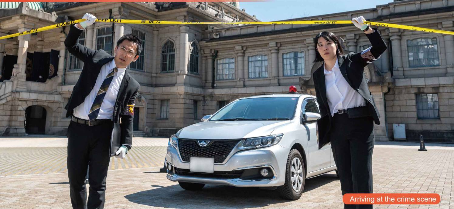
Arriving at the crime scene