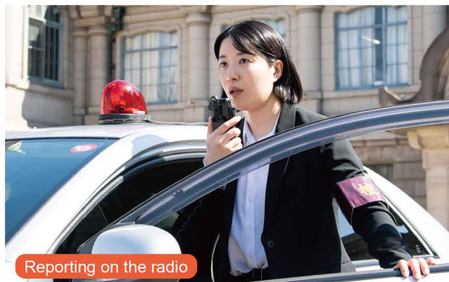
Reporting on the radio