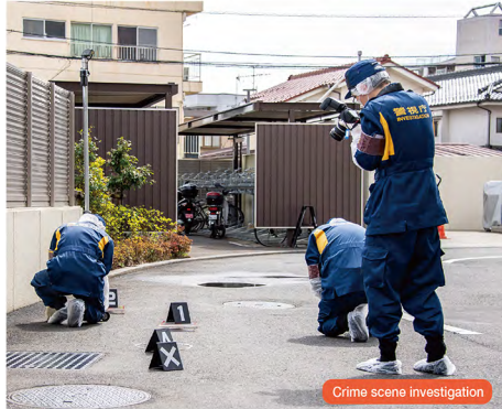
Crime scene investigation

We would greatly appreciate your cooperation in providing any information concerning the cases listed here.