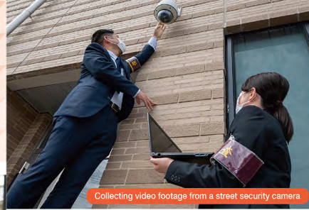
Collecting video footage from a street security camera