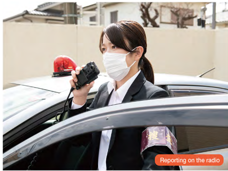
Reporting on the radio