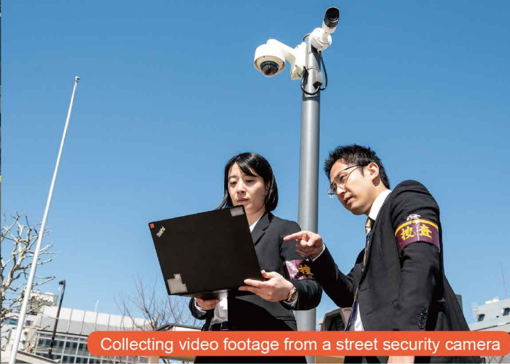
Collecting video footage from a street security camera