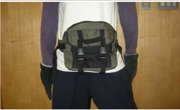
Photo of a duplicate hip bag around the waist Length of the belt: 83 centimeters

It is 130 cm by 30 cm in size, acrylic-made, and green base with red, black, orange, dark green checks.