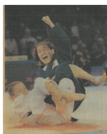
Ryoko Tamura (Tani) (Gold in Judo)