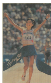
Naoko Takahashi (Gold in Marathon)