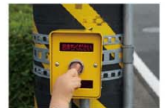
Push the button to cross the road.