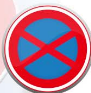
No Parking or Stopping