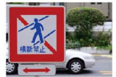
Pedestrian Crossing Prohibited